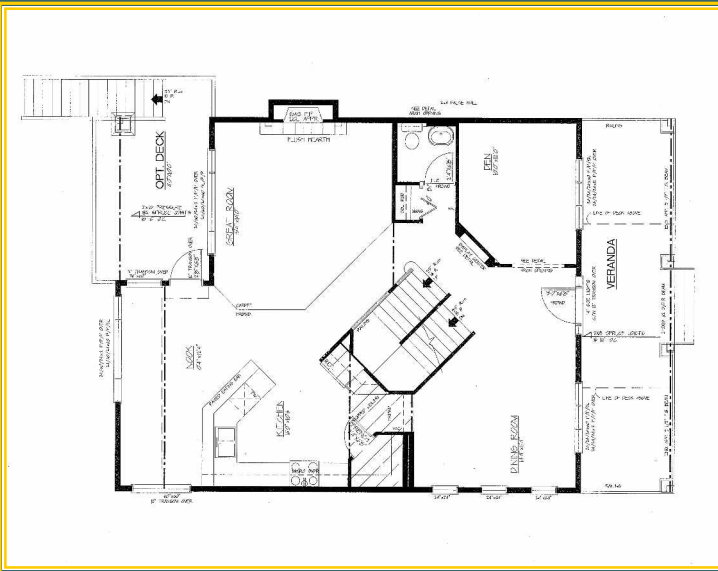
Main Floor Plan @ 1,168 sq. ft